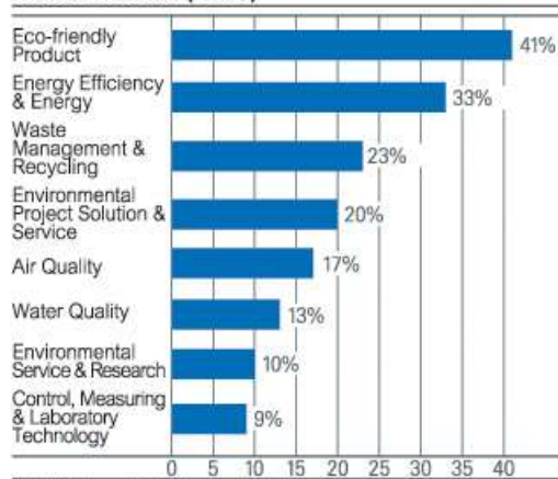
Visitor interest (2009)*

In response to the worldwide agenda on climate change, the theme of the fair will be " Business Solutions to Climate Change " which also demonstrates the role of Hong Kong as an international marketplace for innovative environmental technologies. To meet with the region's environmental needs, special focus will be placed on green building and electric vehicles in addition to the main exhibit profile of air quality, energy efficiency & energy, waste management & recycling and eco-friendly product.